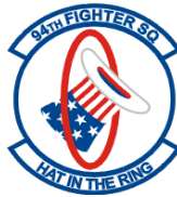
94 th Fighter SQ