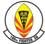
199 th Fighter SQ