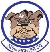
525 th Fighter SQ