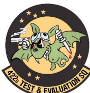
422 nd Test & Eval SQ