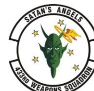
433 rd Weapons SQ